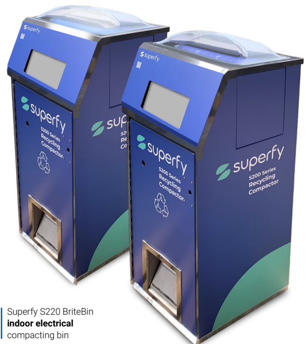
Superfy S220 BriteBin indoor electrical compacting bin

There are two options for the waste opening. A Hopper which we recommend is cleaned every 2-3 months. Or alternatively, a Flap opening which is more commonly used as it does not require cleaning. (The size of the waste opening can be customised).